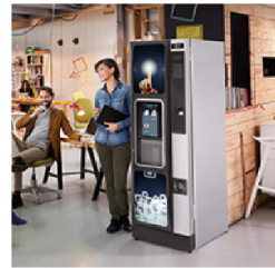
Innovative thus simple user interface